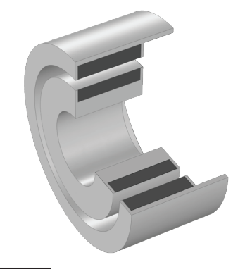
FIGURE 1. Schematic of a magnetic coupling.

"One of the big advantages of COMSOL from my point of view is that you can do many kinds of simulations; you can include many kinds of physics and these physics can interact with each