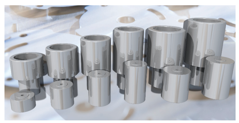
FIGURE 3. Standard magnetic couplings.

Simulation apps allow the user to vary parameters without having to alter the underlying computational model. "Sales people can change dimensions and perform simulations while they're on the phone with clients to verify agreement with their specifications within minutes," says Bendixen. But despite the simplicity of the interface, there is still extensive flexibility to be innovative with design iterations. Sintex's apps let the user adjust both geometric and magnetic parameters. The model then calculates the critical temperatures of the magnets, remanence distributions, magnetic field flux densities, torgue, and can losses. Figure 4 is an example of an app that simulates the eddy currents generated in the separator can. These currents can then be used to calculate the resulting power loss. Now, people at all stages of development can contribute to the design process and help maximize reliability in their products.